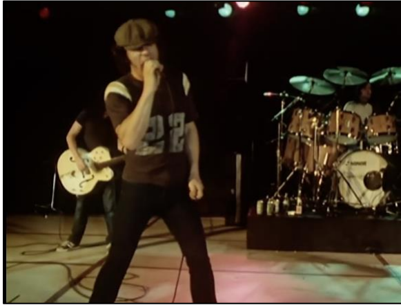
AC/DC "Back in Black"