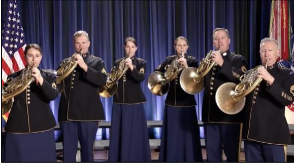
The U.S. Army Field Band – Horn section “The Star-Spangled Banner” https://youtu.be/OO1Q-3kXctM (1:13)